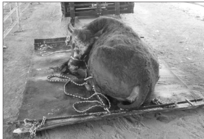
Move a downed cow by rolling the animal onto the rubber sling.