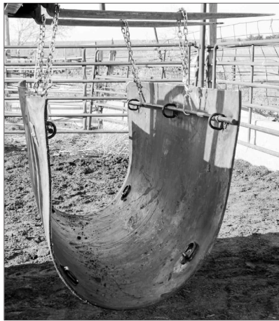
Double D Sled 'n Sling is a six-foot by eight-foot solid rubber sheet that is a half-inch thick.