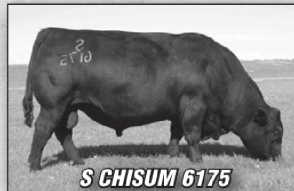
S CHISUM 6175