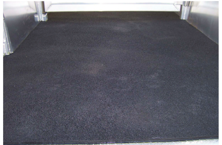
WERM flooring can be applied in new or used aluminum stock trailers to help reduce noise and livestock slipping.

INJURED LIVESTOCK COULD MEAN INJURED PROFITS