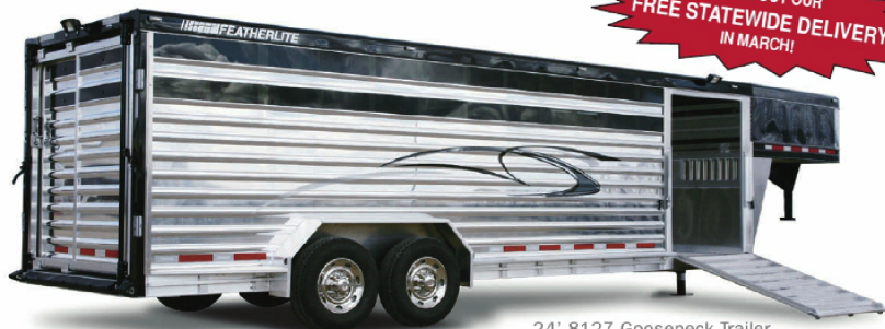
24' 8127 Gooseneck Trailer

ASK ABOUT OUR FREE STATEWIDE DELIVERY IN MARCH!