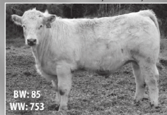
BW: 85 WW: 753

The sale will be broadcast live on www.dvauction.com . Auctioneer: Dan Clark