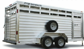
16' 8107 Bumper Pull Trailer