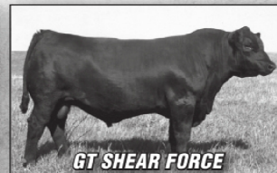
GT SHEAR FORCE